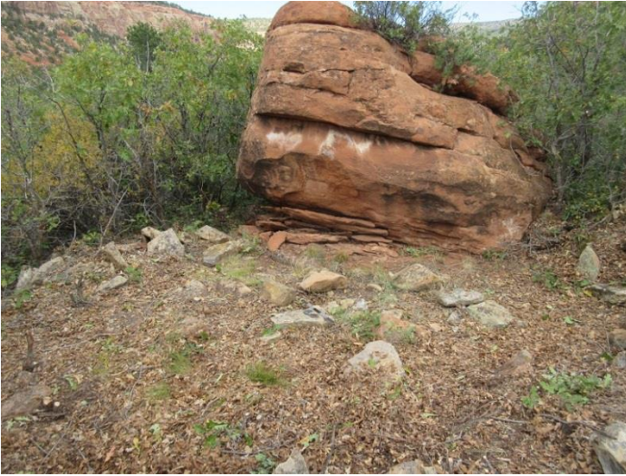
The Huscher site (5ME21948)