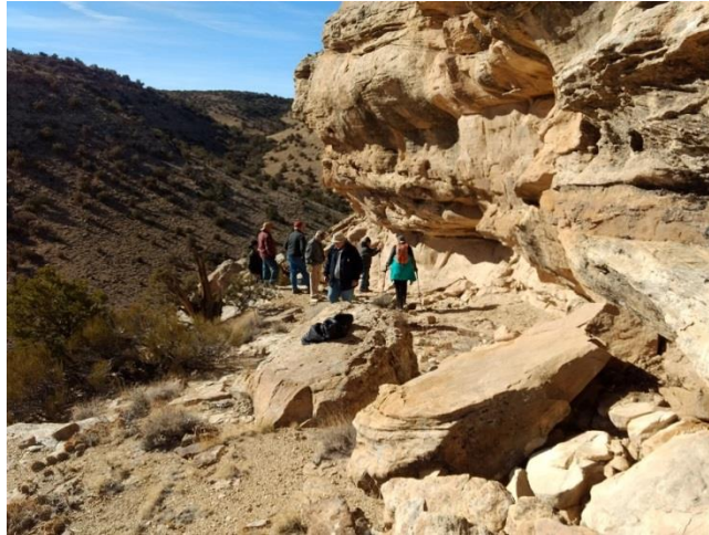
Chapter members viewing the Hauser Shelter site in Dry Creek Canyon.

All three sites on the outskirts of Montrose are being monitored by Chipeta Chapter site stewards.