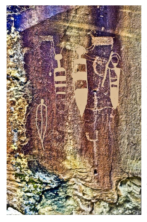
Enhanced image from the Green River Study Area